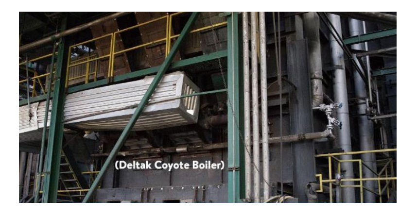
Oregon Biochar Solutions Chardirect.com