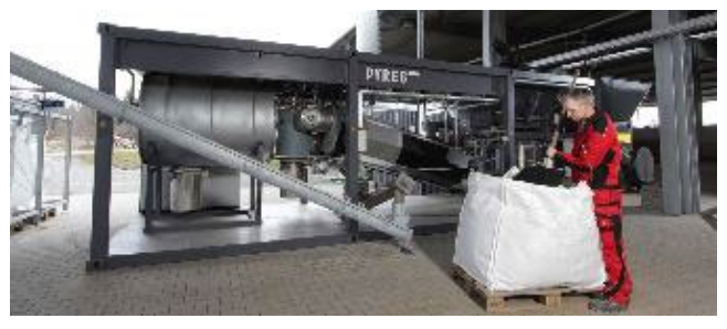
Pyreg 500 Pyreg.de