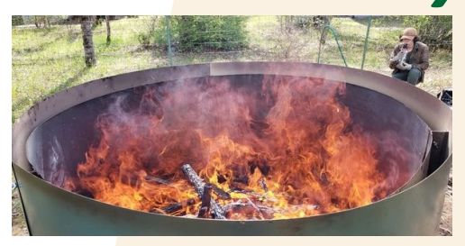
"Ring of Fire"