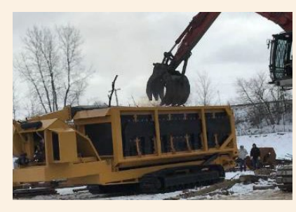
Carbonator 6050 tigercat.com