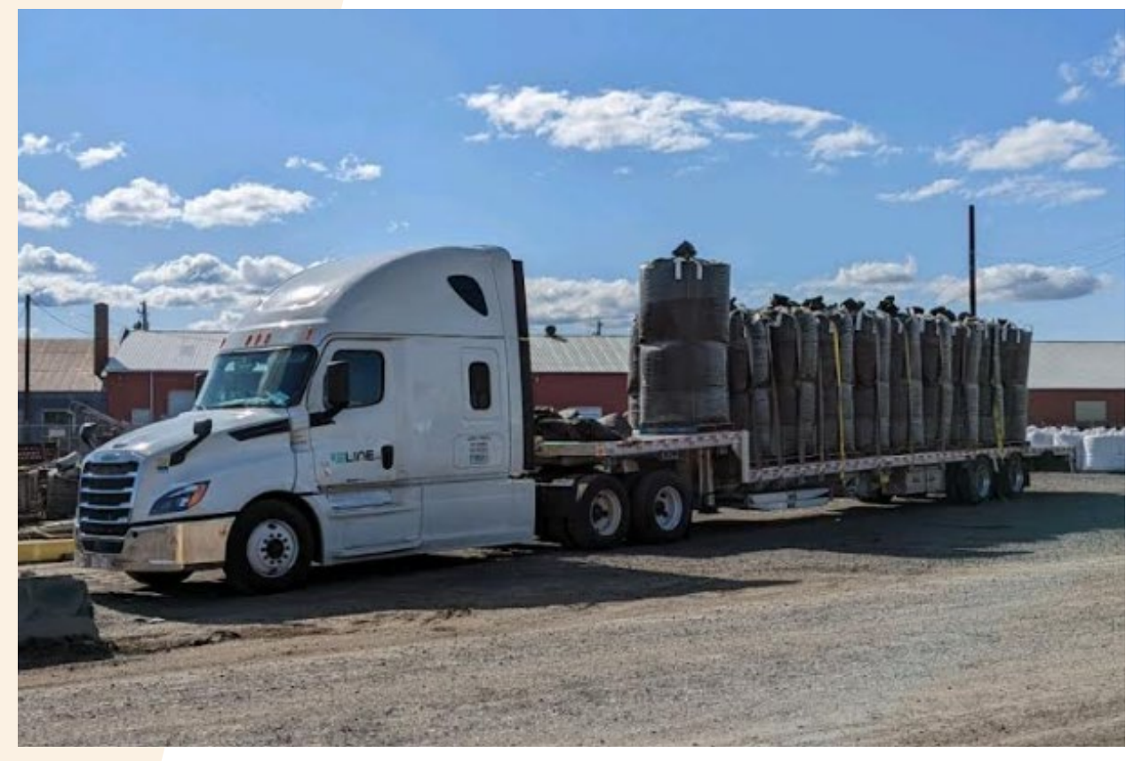
A step deck flatbed truck loaded with 19 pallet of 4 yards – 76 cubic yards of biochar on board. Biochar Solutions LTD.