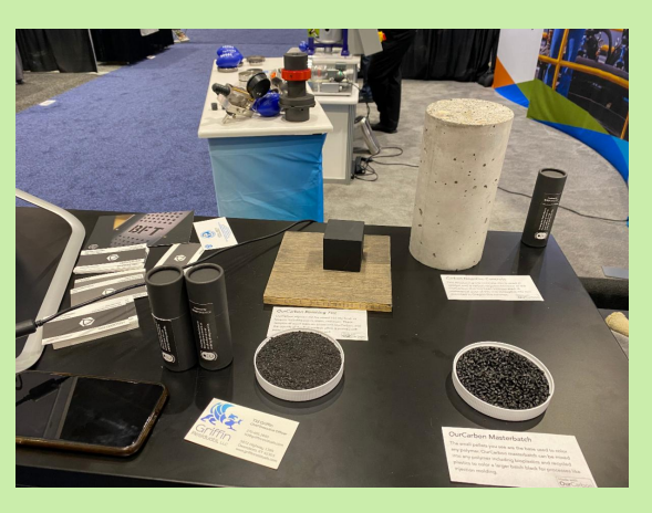
Bioforcetech exhibits products from biosolids biochar at WEFTEC.