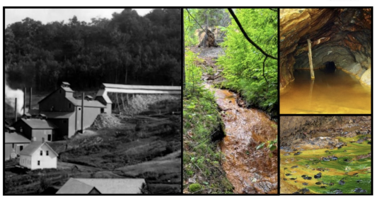
Pike Hill Copper Mine – Vermont Superfund Site Clean Maine Carbon is a proud supplier of premium biochar to support the water and soil remediation project at Pike Hill.